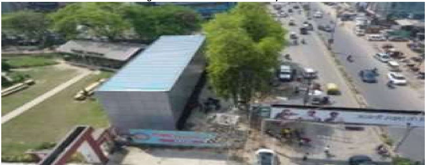
Fig- 2 MLCP (33 Cars) At Gandhi Udhyan