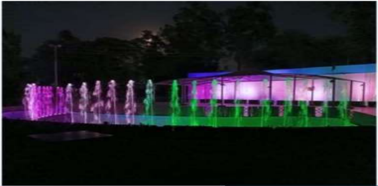
Fig-1 Musical Fountain At Gandhi Udyam