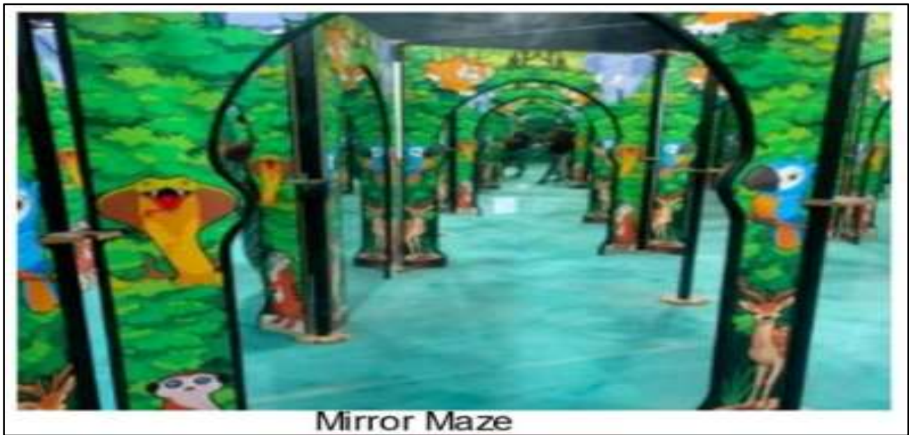
Figure 1: Mirror Maze Project Profile- Musical Fountain & MLCP At Gandhi Udhyan

Smart city has been selected in round 4 under the smart city program by the Government of India. As part of Smart City projects, BSCL has implemented a project titled "Musical walkover Fountain" and Cafeteria development at Bareilly. On the Outer boundary of Gandhi Udhyan, Smart city has also installed a MLCP with capacity of 29 cars in puzzle parking method. The Following RFP is for selection of Agency for Operation and maintenance services of Musical Fountain, Café vending Zone and MLCP in Gandhi Udhyan, Bareilly for three years.